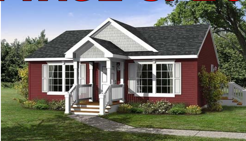
EXTERIOR SHOWN WITH CERTAIN FEATURES THAT MAY BE OPTIONAL