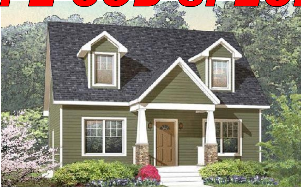
EXTERIOR SHOWN WITH CERTAIN FEATURES THAT MAY BE OPTIONAL